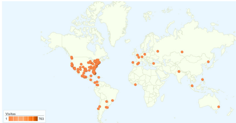
1.726 visitas provinieron de 262 ciudades.

You can expect your banner to be shown between 1,000-2,000 times per month. Having visits from 31 countries, mainly from United States, Mexico, Canada and Colombia.